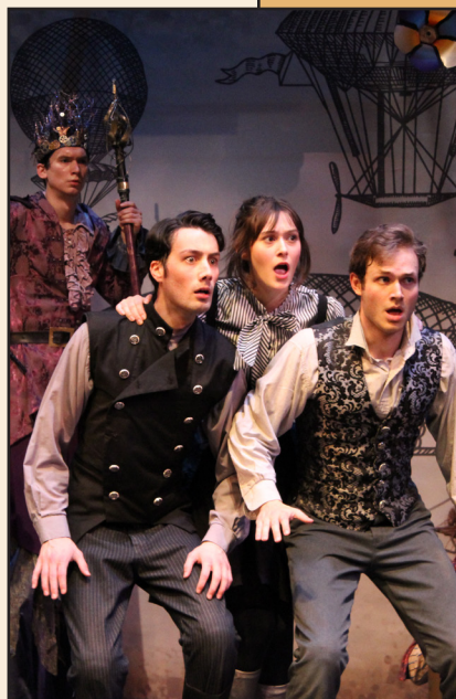
Demetrius and Lysander protect Helena in the 2019 touring production of A Midsummer Night's Dream .

Isaac Asimov notes that "there is a folk belief that extreme heat is a cause of madness (hence the phrase 'midsummer madness') and this is not entirely a fable. The higher the sun and the longer it beats down, the more likely one is to get sunstroke, and mild attacks of sunstroke could be conducive to all sorts of hallucinatory experiences. Midsummer, then, is the time when people are most apt to imagine fantastic experiences."