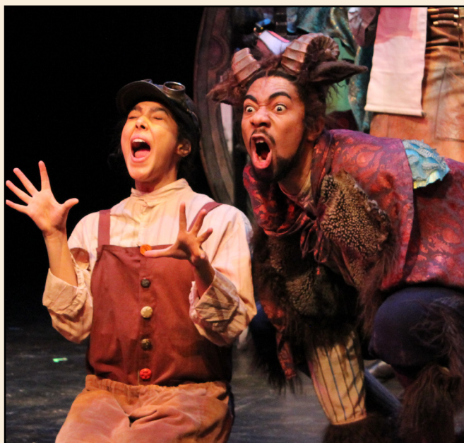
Puck and Snug from the 2019 touring production of A Midsummer Night's Dream.

5. Transformation is a major theme in this play. How are the characters transformed from the beginning to the end? Does the situation at the end of the play represent a new and improved reality, or are these transformations only skin deep?