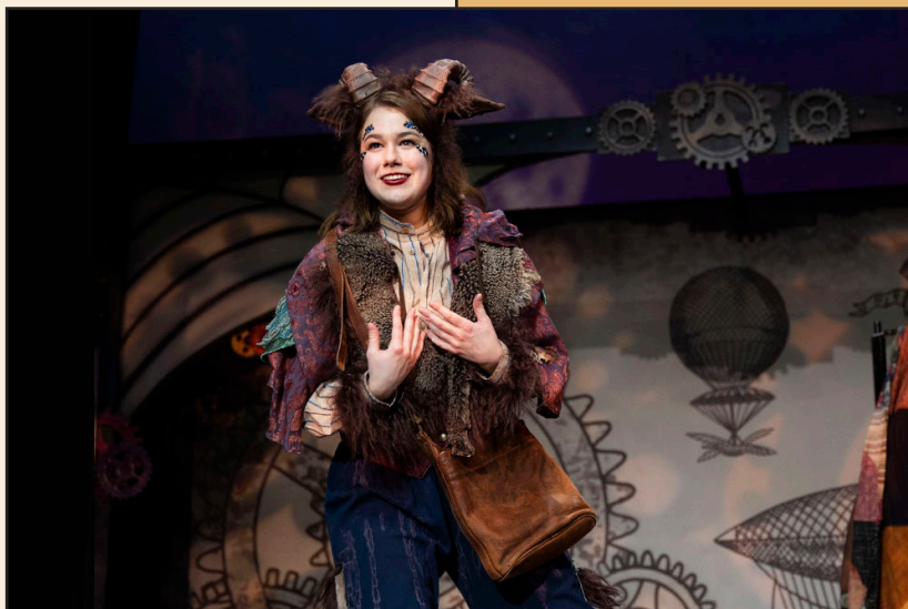
Puck in the 2021 touring production of A Midsummer Night's Dream.

The story of Pyramus and Thisbe is found in Ovid's Metamorphoses , and its plot is strikingly similar to that of another Shakespeare play written around the same time as Midsummer — Romeo & Juliet .