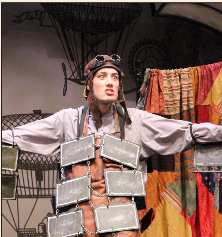
Snout as 'Wall' from the 2019 touring production of A Midsummer Night's Dream

Available versions of Midsummer on video include the 1935 Warner Brothers film, the 1968 RSC production, the 1982 NYSF Central Park production and Michael Hoffman's 1999 film. Choose two versions of the same scene, such as the meeting of Oberon and Titania in II.i, and show each to the students, asking them to observe how the actors in each production speak, interpret and move to the language. Make frequent use of the pause button to stop and ask specific questions, then rewind and let them watch the entire scene through uninterrupted. How are the two versions of the scene different? How are they similar? Which version was easier to understand? Why? Support your answer.