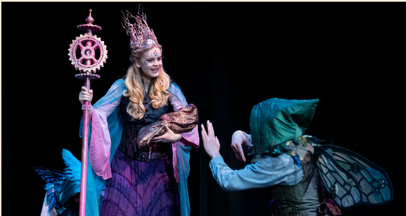
Titania and the Fairies in the 2021 touring production of A Midsummer Night's Dream.