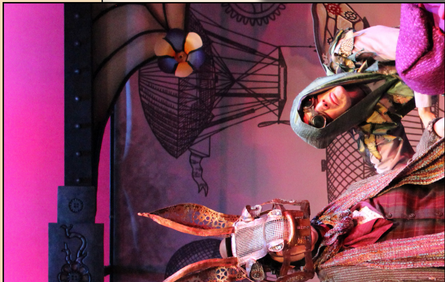
Bottom and the Fairies from the 2019 touring production of A Midsummer Night's Dream .

The names of the Mechanicals mostly reflect their occupations. Bottom, the weaver, is named for a skein of yarn or thread, called a "bottom." The name of Quince, the carpenter, suggests "quines," or blocks of wood used by carpenters in building. Flute is a bellows mender-- the bellows has a fluted shape, and was used to compress air to stoke a fire or to produce sound (as in a church organ). Snout, the tinker, would have been a mender of pots, pans and kettles-- the spout of a kettle was often called a "snout" in Shakespeare's time. Snug is a joiner, one who manufactures cabinets and other jointed furniture made of snug-fitting pieces of wood. Finally, in Shakespeare's time, tailors were usually depicted as abjectly poor and thus, rail-thin from hunger— in other words, "starvelings."